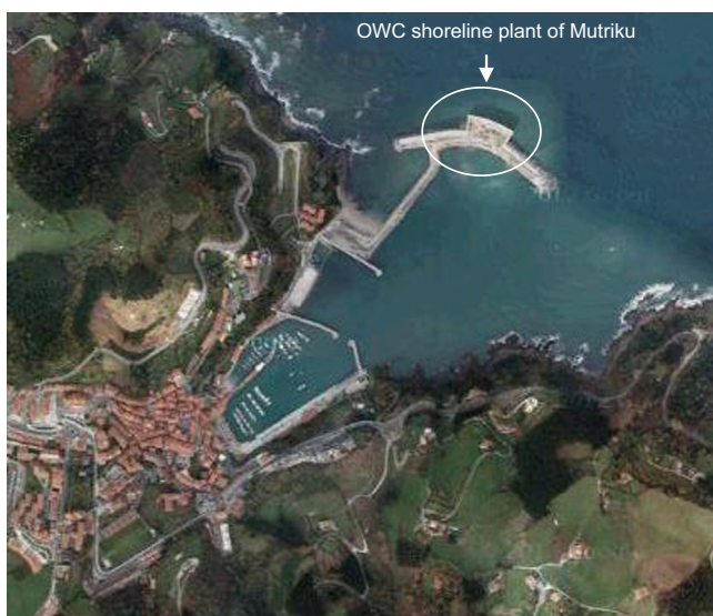
Fig. 1. Bird's eye view of Mutriku harbour and the breakwater.